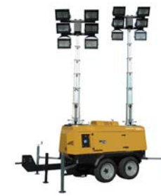
Twin Mast Tower