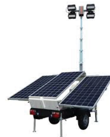
Solar Lighting Tower