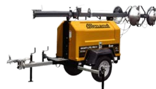
Wheeled Trailer Mount